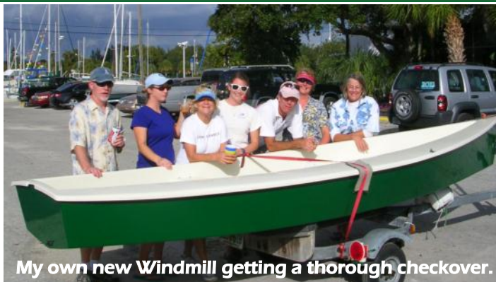
My own new Windmill getting a thorough checkover.

Hulls 3 and 4 were purchased by the Bixbys and Sponars, as each wanted custom hull colors. We received 5700 at the South-erns, and had it rigged up and